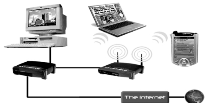
Figure 2: Mobile Adhoc Networks

In this paper we start the discussion with the introduction then section 2 of this paper contain some potential safety related applications of VANETs and