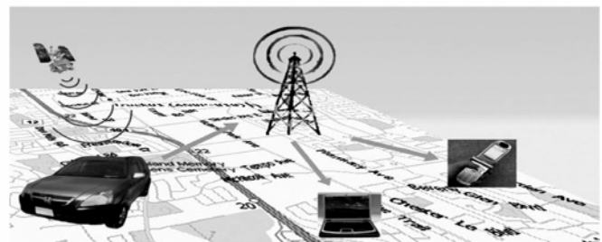
Figure 1: Vehicular Communication Networks on Road

Considering the tremendous benefits expected from VANET, it is clear that car-to-car communication is likely to become most relevant realization of mobile ad-hoc networks. But besides the benefits such communication raises various formidable challenges.