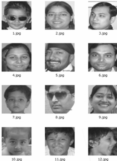
Fig.3.1: Face Space

Prepare a training set. For training set, we first need to collect a set of face images. These face images become our database