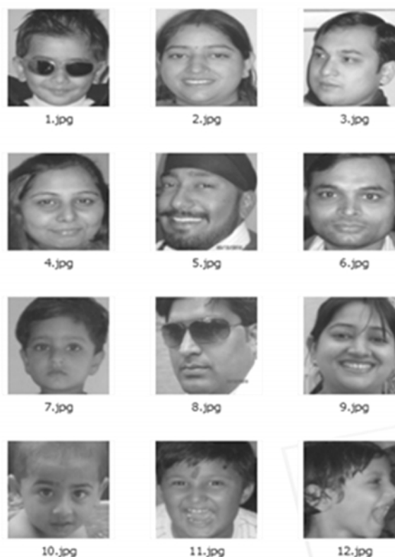
Fig. 4.1: Test Database

An experiment with a database that contains only 12 subject's images has been performed to ensure how well the eigenface system can identify each individual's face. The system has been implemented by MATLAB. 12 subjects are selected as test set and each subject have 2 images as training set