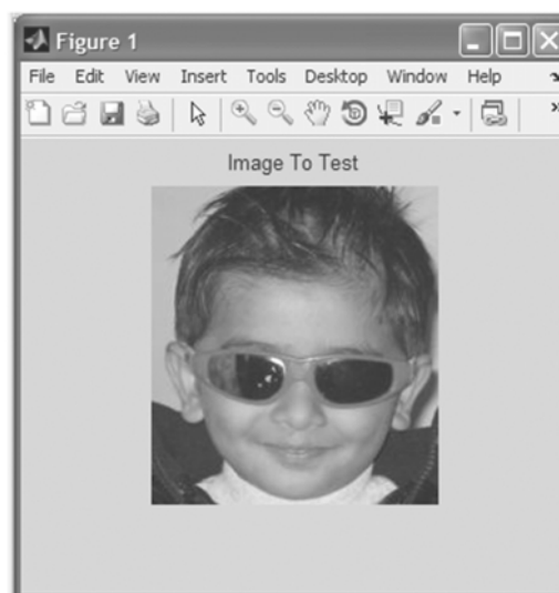
Fig. 4.2: Image to Test