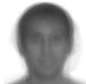
Fig. 3.2: Average Face

We then compute each face's difference from the average: